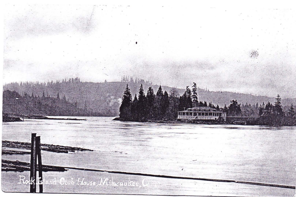
Rock Island Club House, Milwaukie, Oregon